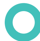
MISSIONAL BLUE TINT

Pantone 375 C47 M0 Y100 K0 R149 G201 B61 HEX 95C93D