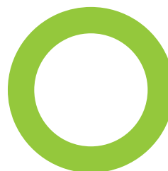
NEW LIFE GREEN

Pantone 7597 C10 M90 Y100 K0 R220 G65 B40 HEX DC4128