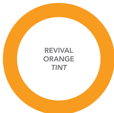
REVIVAL ORANGE TINT

Pantone 1375 C0 M45 Y97 K0 R249 G157 B34 HEX F99D22